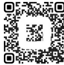
(Scan me here!)

In the message box indicate that you want your donation to go to Sunday Collection, or a Special Collection.