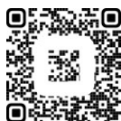
(Scan me here!)

Please call or email our offices to register with our parish, to arrange for weekly ICC Offerings Envelopes, or for SAG Information, 250-762-3910 icc.kelowna@nelsondiocese.org