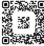
(Scan me here!)

Please call or email our offices to register with our parish, to arrange for weekly ICC Offerings Envelopes, or for SAG Information, 250-762-3910 icc.kelowna@nelsondiocese.org